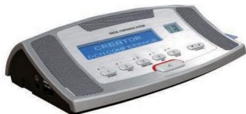
The hidden-mic LCD discussion voting chairman unit CR-DIG5202A2