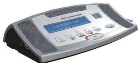
The hidden-mic LCD discussion voting delegate unit CR-DIG5204A2